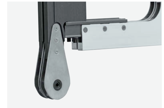
DRC 1E link