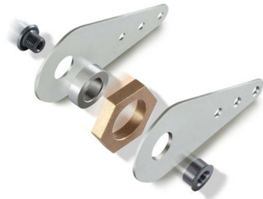
DRC 1E links and studs