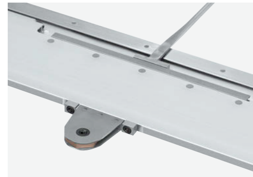
DRC 1E stud

High-quality, wear-resistant materials insure reliable, durable function with minimal maintenance requirements.