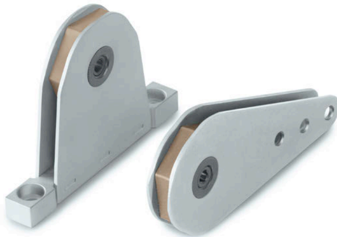
DRC 1E bronze execution