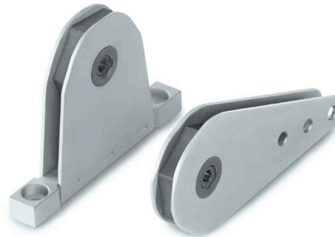
DRC 1E composite execution