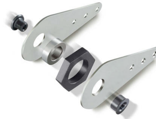
DRC 1E links and studs