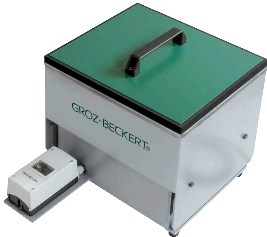
Prior to cleaning